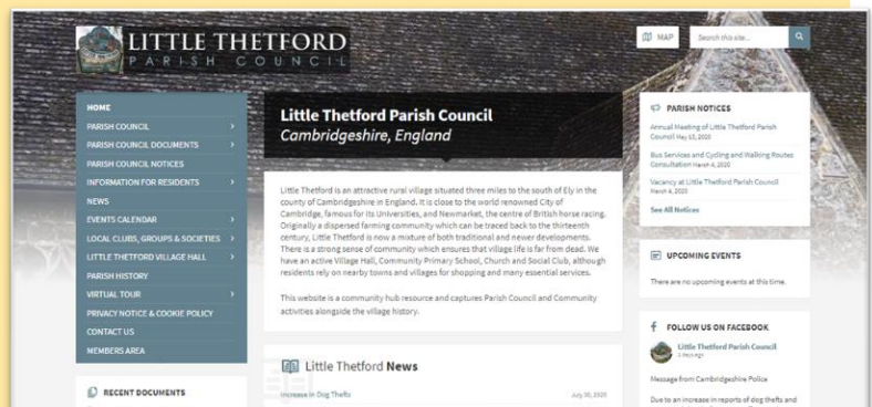
Screenshot of the new website

in the year. Please keep an eye on these for up to date information and news of interest in the village.